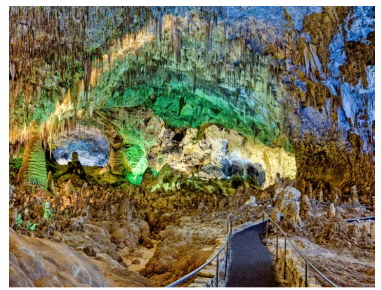
sump calcite helictite